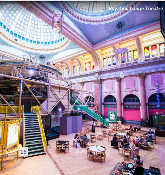
Royal Exchange Theatre