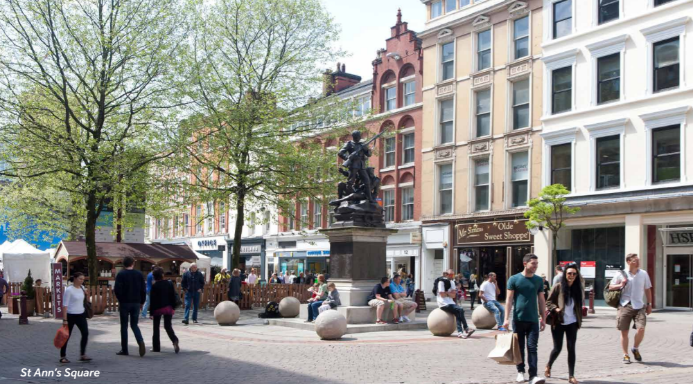
St Ann's Square