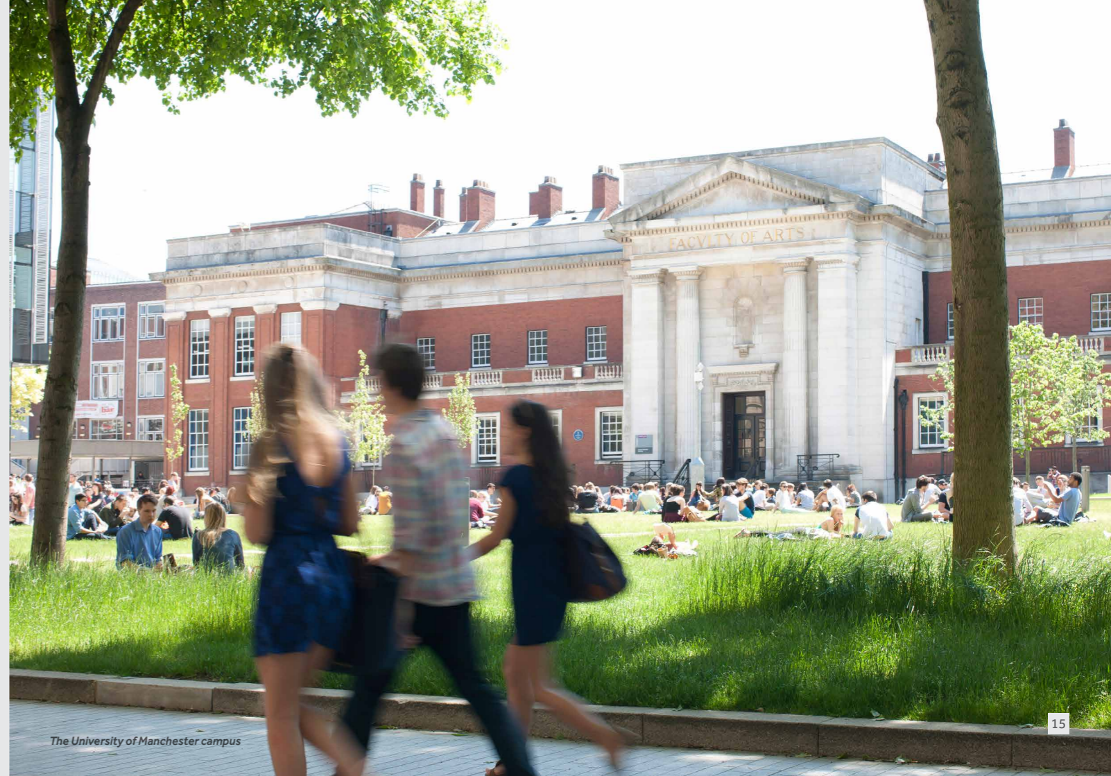
The University of Manchester campus

Manchester also has two other universities, Manchester Metropolitan University and the University of Salford.