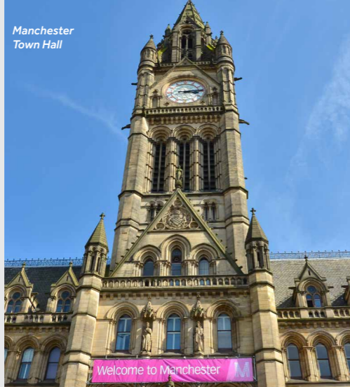
Manchester Town Hall

Manchester offers a temperate climate with mild summers and cool winters. The city is well equipped for those hot days with numerous parks and outdoor spaces in the city centre and surrounding areas.