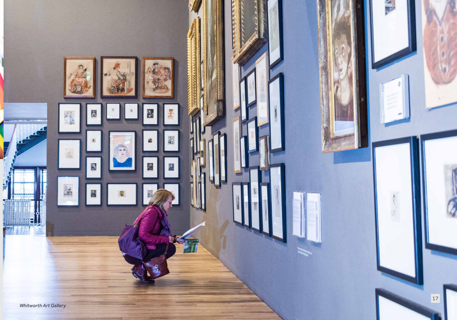
Whitworth Art Gallery

A more recent addition to Greater Manchester's cultural scene is Media City UK, a new waterfront destination that has been home to the BBC since 2011, producing many television and radio shows.