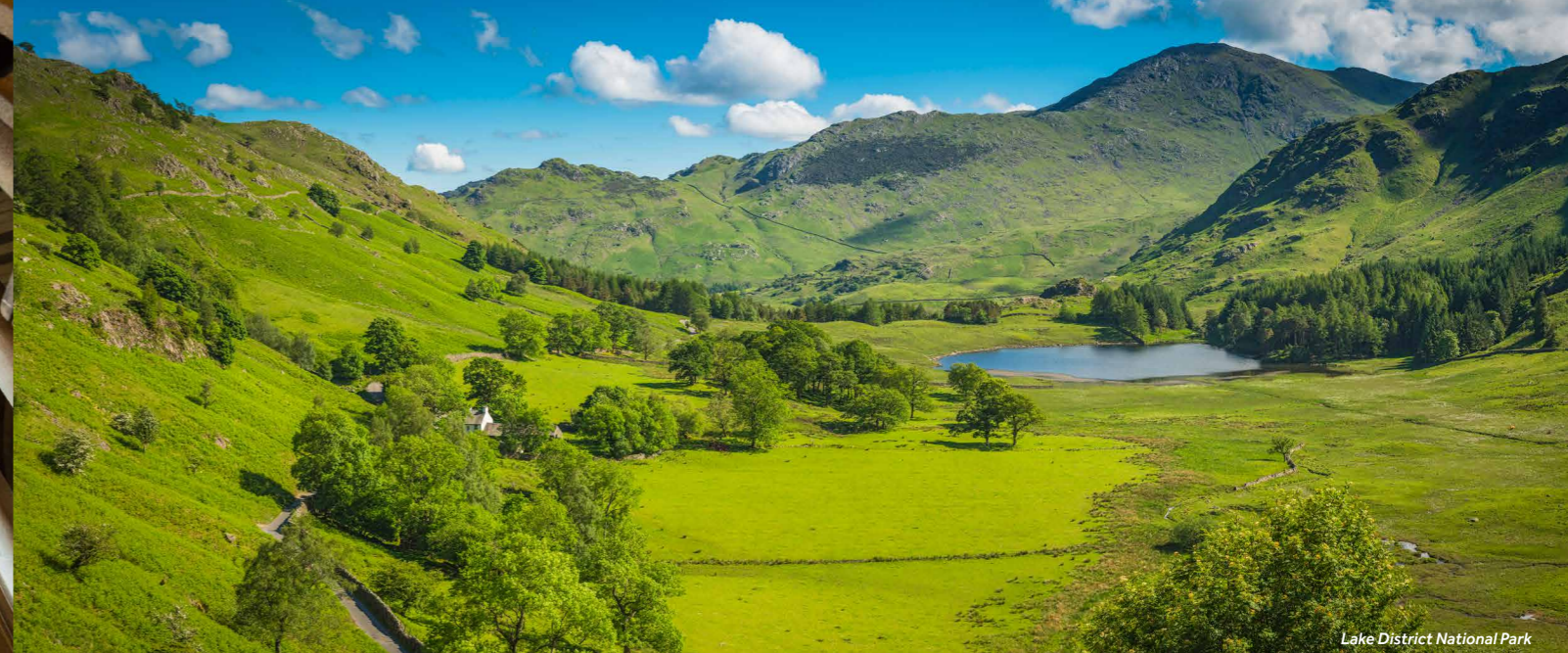
Lake District National Park