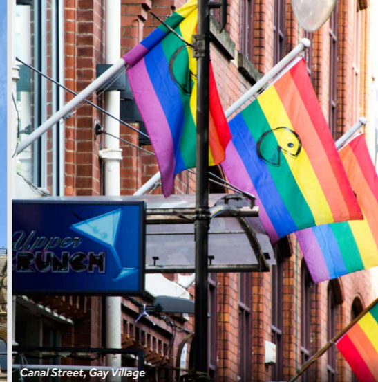
Canal Street, Gay Village