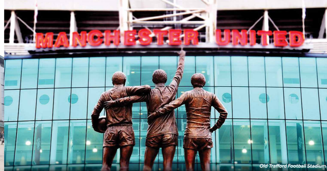
Old Trafford Football Stadium