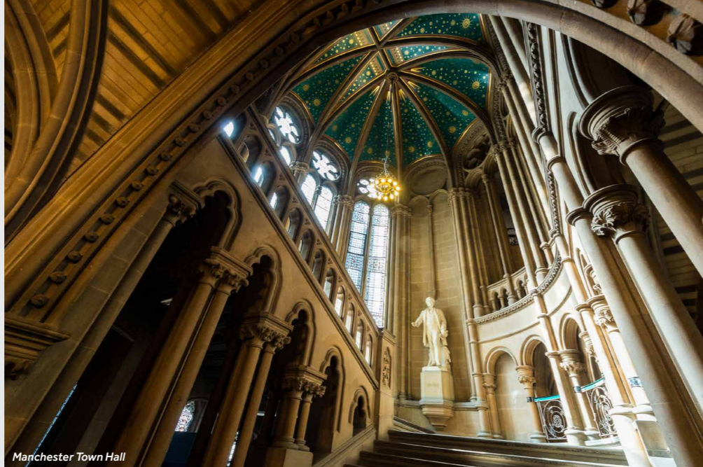
Manchester Town Hall

The architecture of Manchester demonstrates a rich variety of architectural styles from the Victorian to the contemporary, resulting in a distinctive cityscape. The city is a product of the Industrial Revolution and is known as the first modern, industrial city as can be witnessed in its countless warehouses, cotton mills and the famous canals. Historic public buildings include the Town Hall, Victoria Baths and the neo-gothic John Rylands Library, while many warehouses and mills have been converted to stylish living spaces. The striking Beetham Tower dominates the modern skyline, and tree-lined streets and leafy parks afford a refreshing break from the hustle and bustle of the city centre.